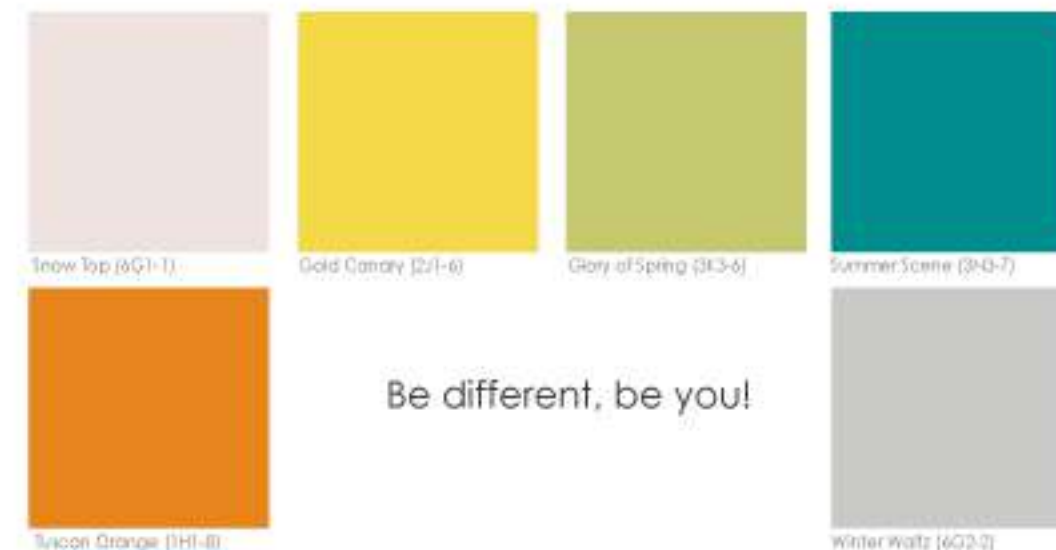
Snow Top (6G1-1) Gold Canary (2J1-6) Glory of Spring (3K3-6) Summer Scene (3H3-7) Sycamore Orange (1H1-8) Winter Waltz (6G2-2)