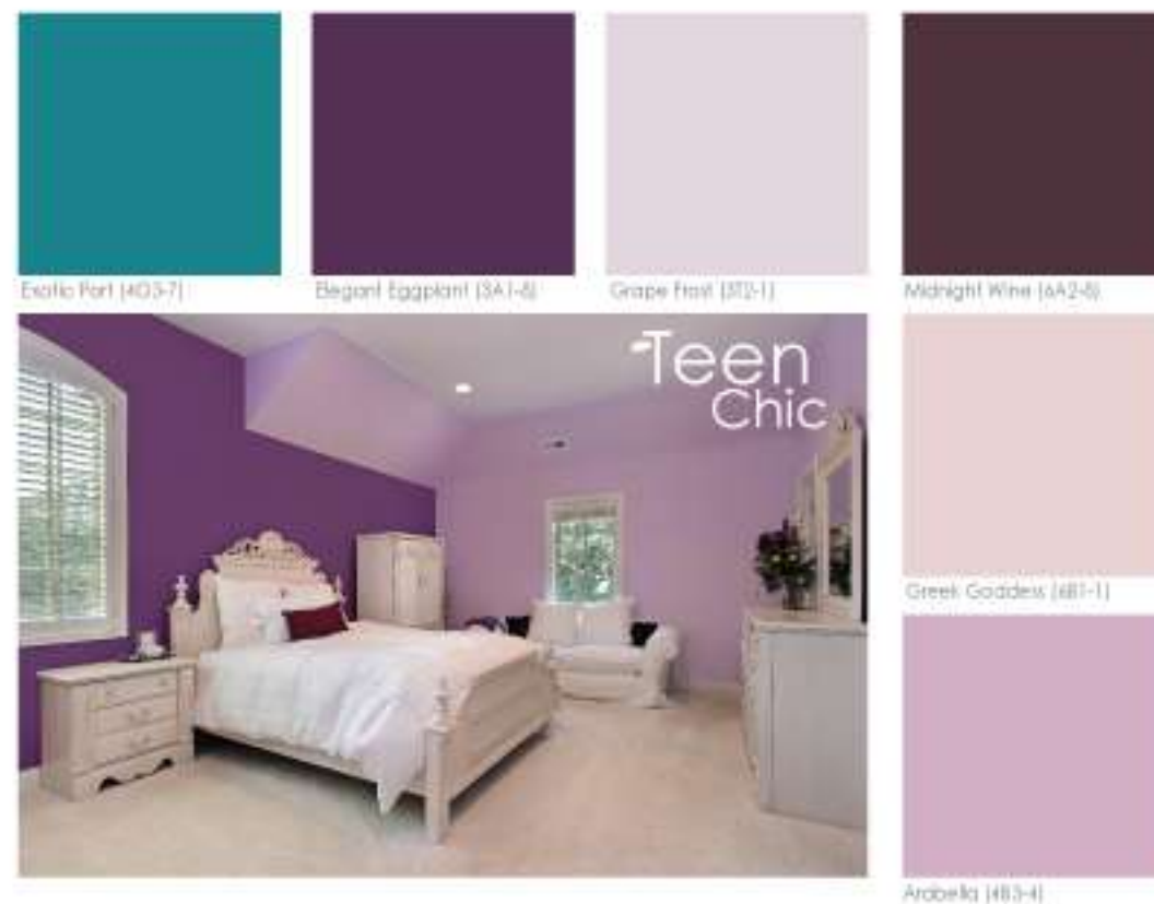
Exotic Port (4Q3-7) Begon Eggplant (3A1-6) Grape Harvest (3D2-1) Midnight Wine (6A2-6) Greek Goddess (4B1-1) Arabella (4B3-4)