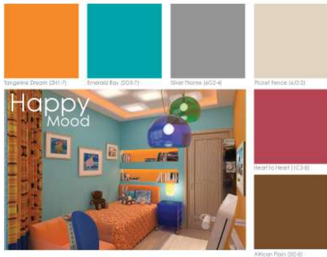
Tangerine Dream (2H1-7) Emerald Bay (2D3-7) Silver Thorns (6G2-4) Picket Fence (4J2-2) Heart to Heart (1C3-8) African Rain (5I2-8)