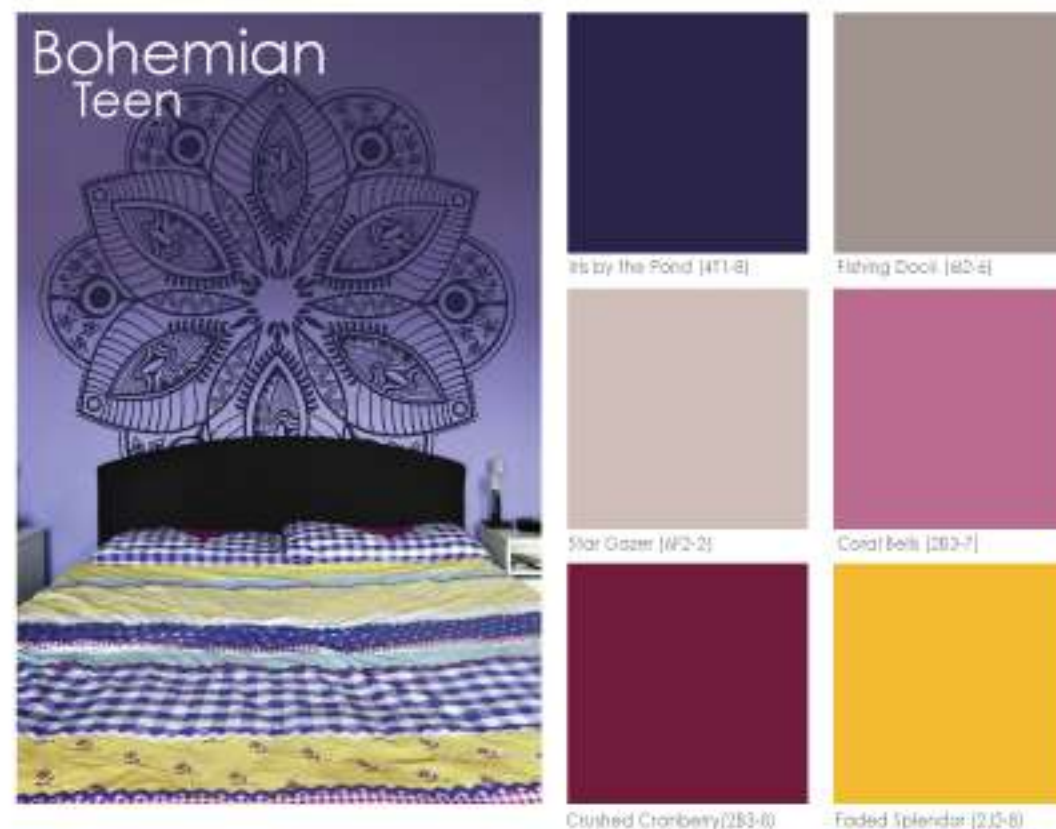
Is by the Pond (4T1-6) Fishing Docks (4Q2-4) Star Gazer (6P2-2) Coral Belt (2B2-7) Crushed Cranberry (2B3-6) Faded Splendor (2J2-6)