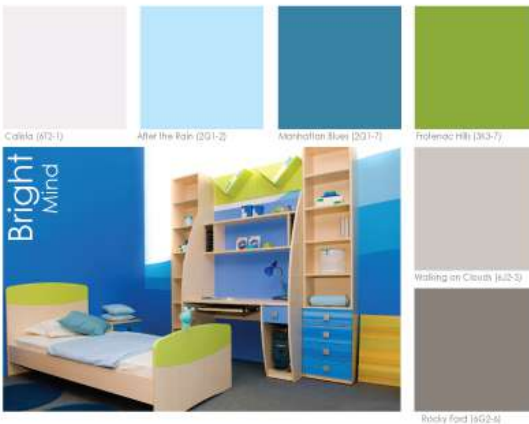
Calista (6T2-1) After the Rain (2G1-2) Manhattan Blues (2D1-7) Frolenac Hills (3K3-7) Walking on Clouds (4J2-3) Rocky Road (6G2-4)