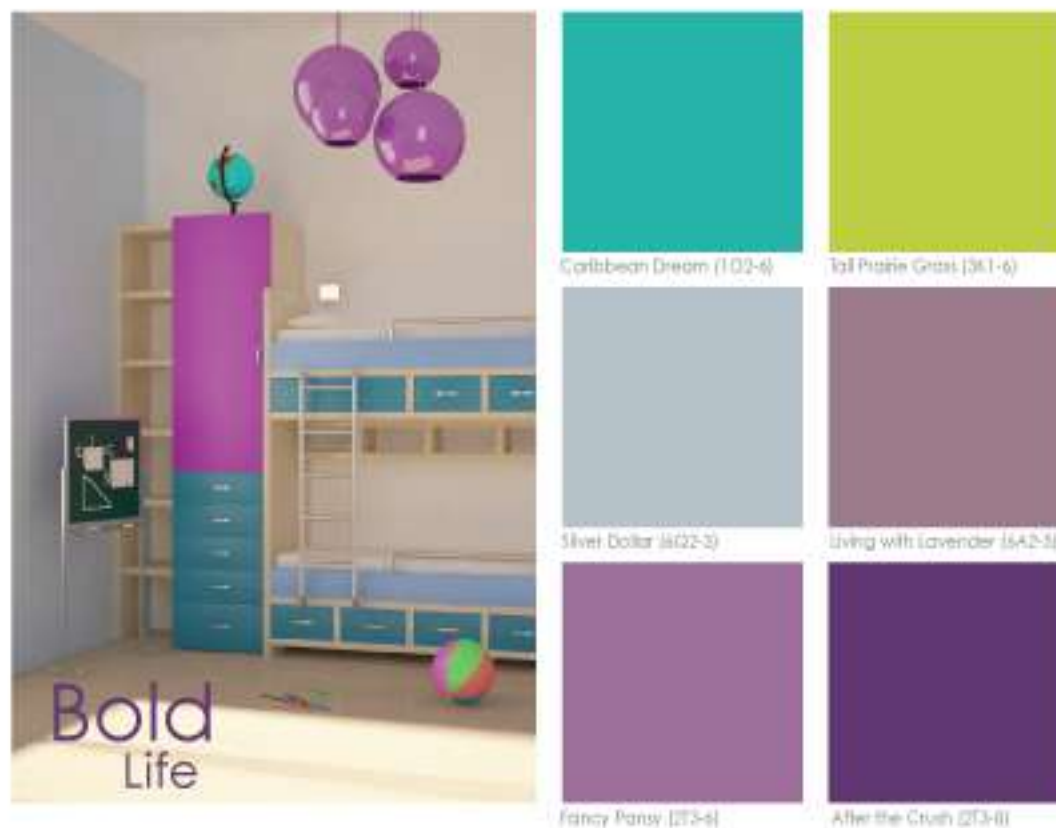
Caribbean Dream (1Q2-6) Top Prairie Grass (3K1-6) Silver Dollar (4Q2-3) Living with Lavender (6A2-3) Fancy Pansy (2T3-6) After the Crush (2T3-6)