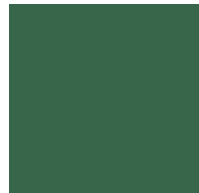
Marble Green 19414 (Sanded) 19314 (Unsanded)

Since all color chips are affected by age, light, heat and mechanical coating processes, chips may vary slightly in color or finish from actual paint in the container. Depending on clarity and depth of color, some colors may require various coats. Photos are illustrated for inspiration only and do not necessarily represent the color on the chips.